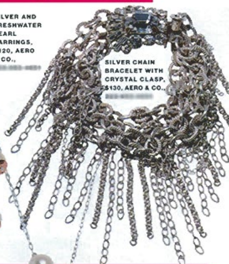
SILVER CHAIN BRACELET WITH CRYSTAL CLASP, $130, AERO & CO., 800-663-6651