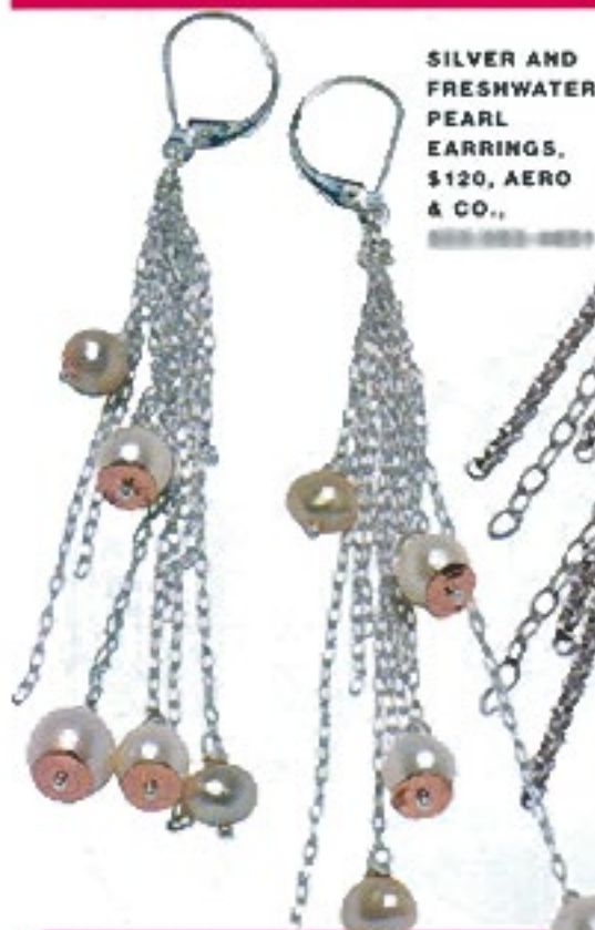
SILVER AND FRESHWATER PEARL EARRINGS, $120, AERO & CO., 800-663-6651