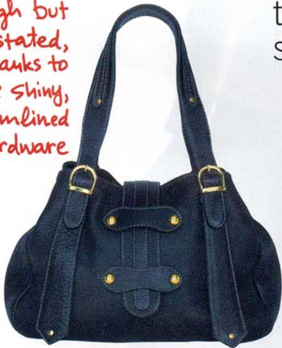
LEATHER "EDIE" TOTE

Tough but understated, thanks to the shiny, streamlined hardware