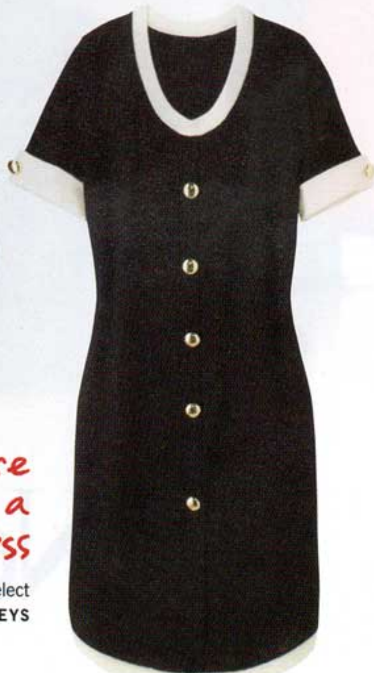
WOOL DRESS $315, Sea New York. Select Barneys New York 888-8-BARNEYS

Sultry studs highlight the gorgeous scalloped seam