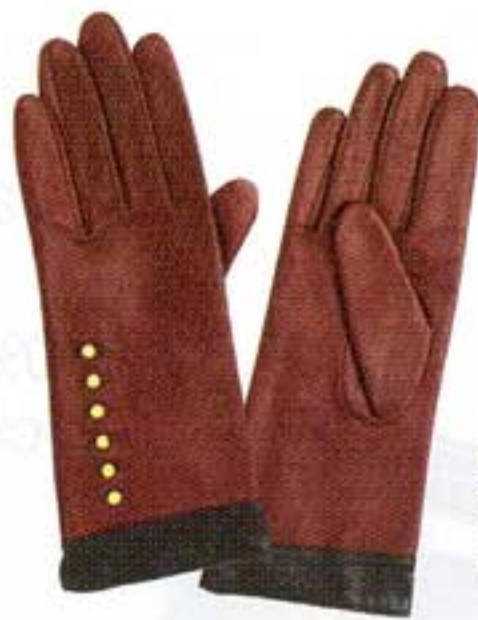
LAMBSKIN GLOVES $48, Fashion Expressions

The ladylike accessory of the season — classic driving gloves