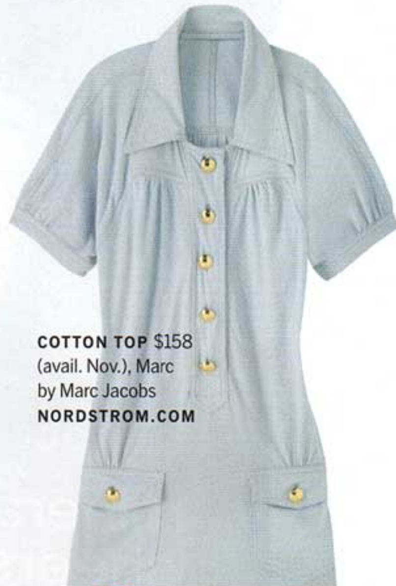
COTTON TOP $158 (avail. Nov.), Marc by Marc Jacobs NORDSTROM.COM

So easy to wear; just throw on thick leggings and flats